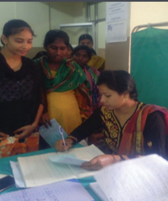
SOLVING PATIENTS QUERIES-COUNSELLING AT OP BLOCK