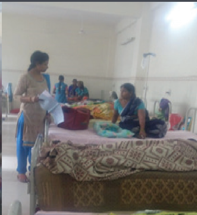
COUNSELLING TO PATIENTS AT IP WARDS