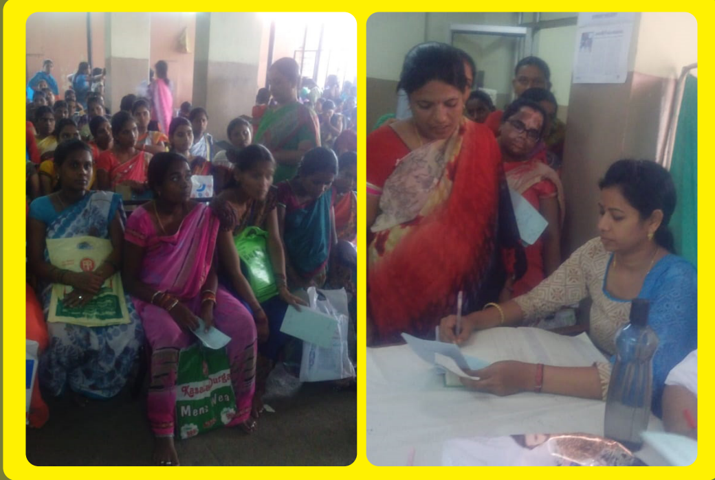
Solving Patients Queries/Counselling at OP Block