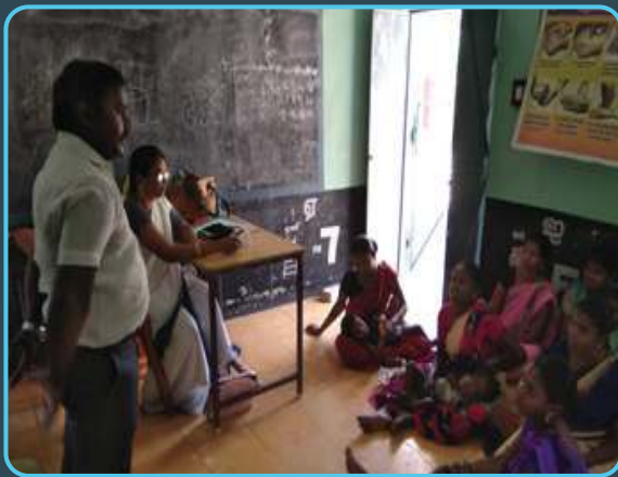
ANC Mothers, Narasingampatti ICDS, Madurai

As per our monthly calendar, the Maternal Child Health Training program was conducted for ANC Mothers, ICDS Teachers, College Students, School Children, Nehru Yuva Kendra and general public. The topics covered were: Govt. Schemes – 108, 104; CM Insurance Schemes; Food & Nutrition and Kitchen Garden. 82 such training programs were held this month across 28 districts in which around 2325 people participated.