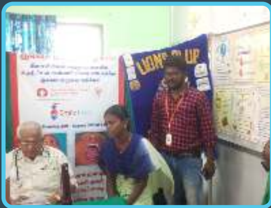
UPHC, Karakudi & Meenakshi Mission Hospital