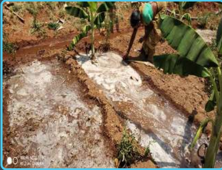
Sainthapatti Panchayat, Dharamapuri

This month, we set up 37 Kitchen Gardens in 28 districts across Tamil Nadu. These were started in ICDS Centres and Schools with the support of ICDS Teachers, School Children & around 107 Volunteers.