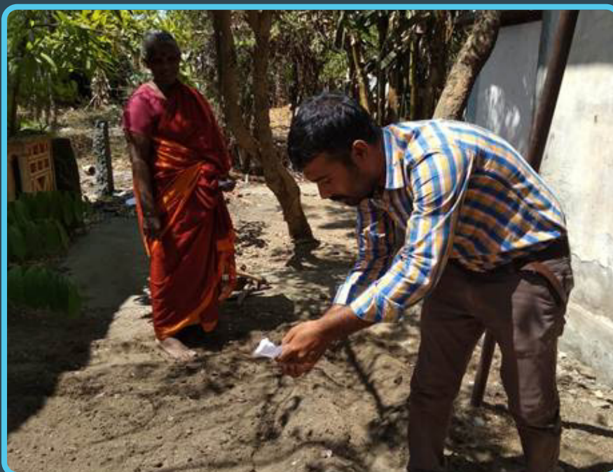
Velauthapuram ICDS Centre, Thoothkudi