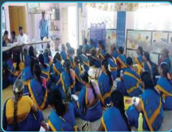
ICDS Teachers, Veppanthattai, Perambalur