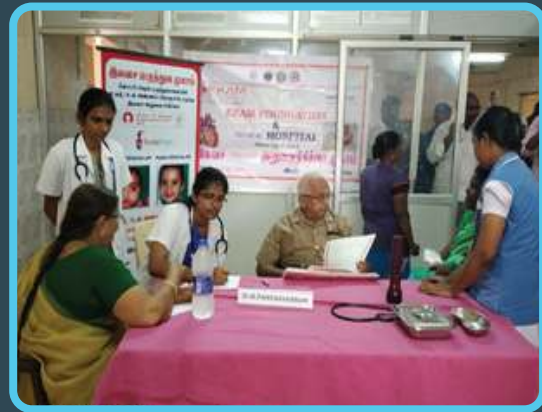
DEIC, Trichy & Meenakshi Mission Hospital