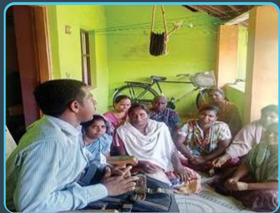
SHG Members, Kesavanputhandurai, Kanyakumari