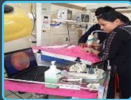
SNCU, Medical College, Thiruvanamalai