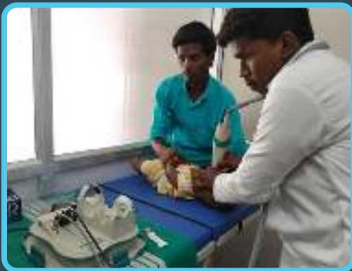
SNCU, Chenagalpettu Medical College, Kanchipuram