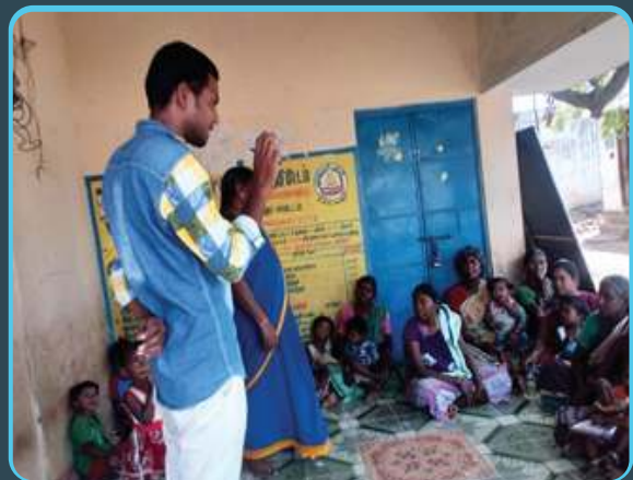
General Public, Periyakadapur ICDS, Thiruvallur