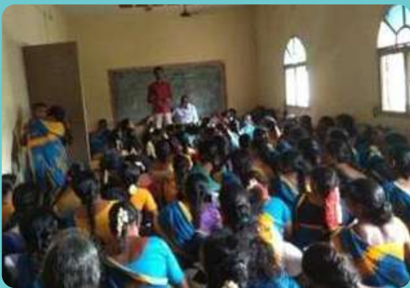
ICDS teachers – Thiruppathur, Vellore

In July, we conducted the Maternal Child Health Training Program for ANC Mothers, ICDS Teachers, College Students, School Children, Nehru Yuva Kendra and general public. The topics during the training were: Govt Schemes – 108, 104; CM Insurance Schemes; Food & Nutrition and Kitchen Garden. Around 2020 people attended 54 such Training programs across 21 districts in Tamilnadu and got benefited.