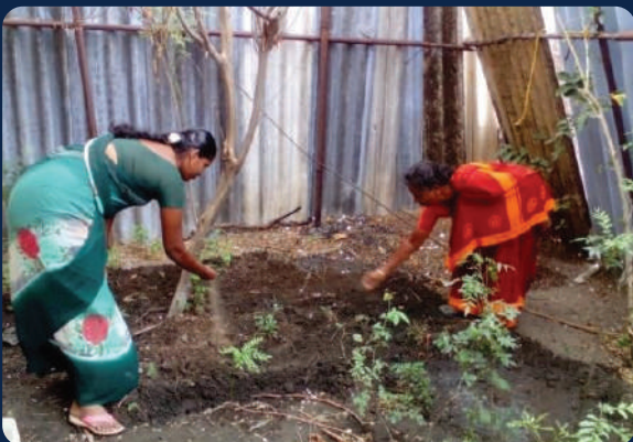
T.Mettupatti ICDS Centre, Tirunelveli