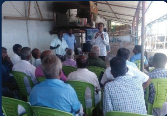
Farmers, Ayan Pommaiyapuram, Tuticorin

We conducted the training program to farmers in Tamilnadu. During the training we have covered topics like natural farming, Muti Corps System, Water harvesting, Kitchen Garden, bore well system and save water. Training is given by Mr.Kannan, Farming Consultant. In this training we have covered around 66 people in 2 places in 2 zones in districts.