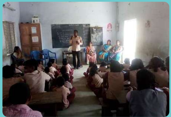
School Children, Annai Chellammal, Kannaiyakumari ANC Mothers, Koilpapakudi PHC, Madurai