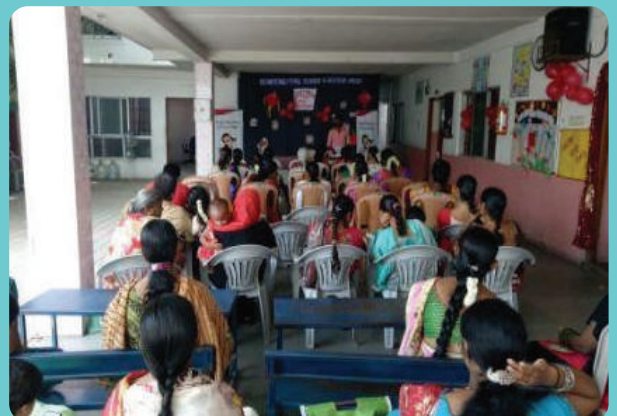
General Public- SVK School, Salem