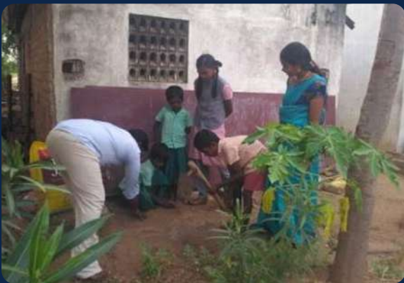
Kalimangalam Govt High School, Madurai

You can never completely trust the fruits and vegetables that you purchase from the market. Can you? Fruits and vegetables which are bought from the shops contain various chemicals which are not good for our health and lead to many diseases. It is advisable to avoid such vegetables and fruits and instead opt for organically grown ones. You can consider going organic by growing them at home. By keeping this in my mind in July 18 we set up Kitchen Garden in 43 places in 18 districts across Tamil Nadu. These were started in ICDS Centres, Schools with the support of ICDS Teachers, School Children & around 137 volunteers.