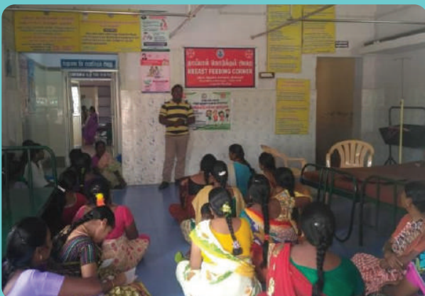
ICDS teachers – Thiruppathur, Vellore