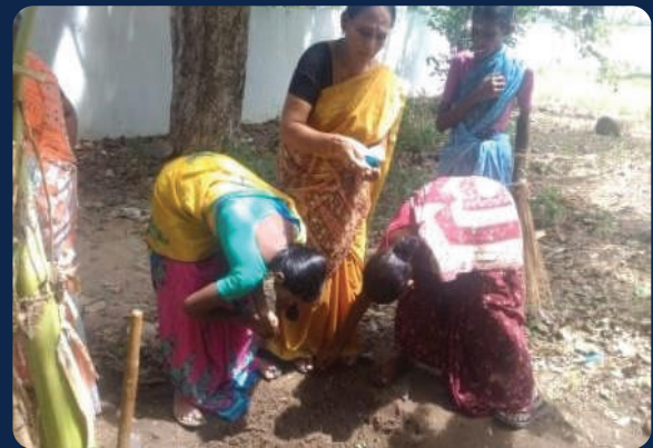
Manjakollai Govt Middle School, Ramnad