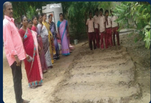
Thappukundu Govt School, Theni