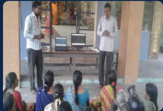
Farmers, Mappilikuppam, Thiruvaur